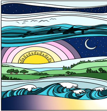
Caring for God's Creation